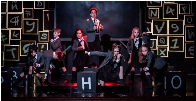
Matilda Jr Pilot 2018